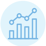
Legal Research and Analysis